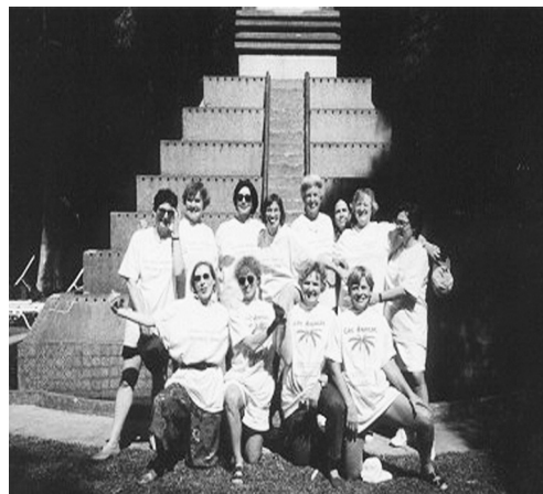
First Group at Ixtapan Spa Hotel